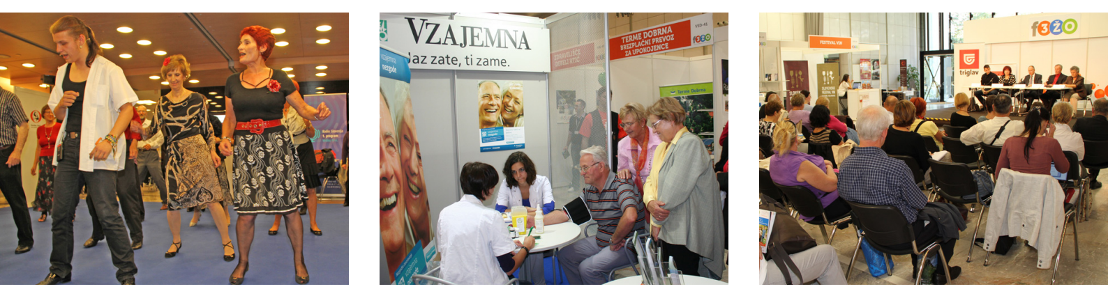
Festival of the Third Age in 2012, Ljubljana

At the heart of the Festival was the trade fair, where more than 200 organizations presented visitors with the exceptional selection of products and services aimed at improving the quality of life of the elderly and encouraging them to lead active lives and socialise with both their peers and younger generations. Participants included numerous public institutions, non-governmental organizations, scientific, educational and cultural institutions, as well as different companies and media. As every year, visitors came to the Festival from around Slovenia and from abroad, with organized groups from