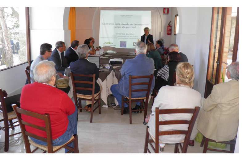
"Conclave" in Erice (Sicily) on June 13, 2013

Article 11 of the Association's statutes stipulates that it will be active in education and training, to promote and provide concrete support