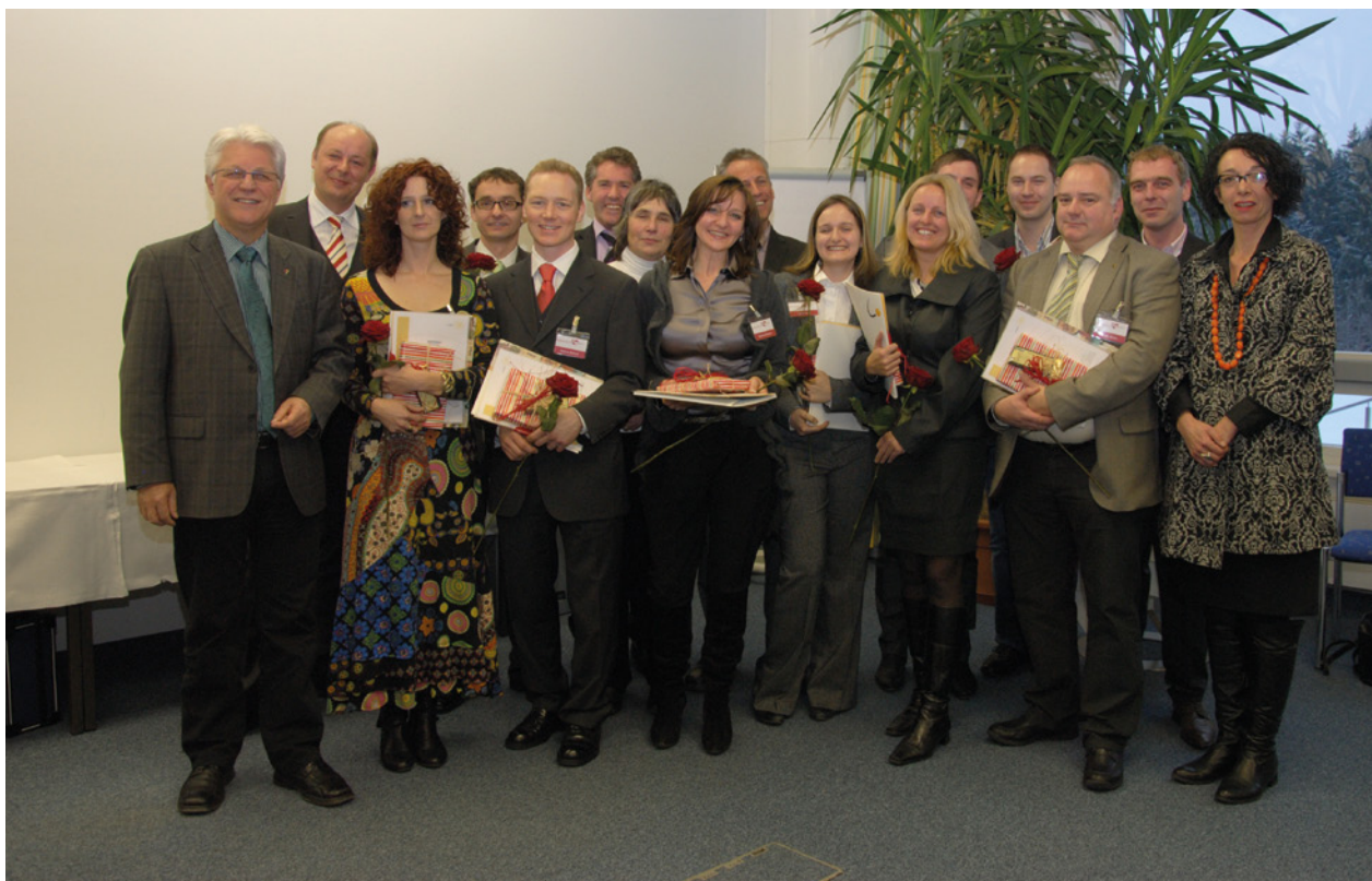
Participants of an E.D.E.-certified course for care home directors in 2012 at the Institut für Bildung im Gesundheitsdienst GmbH (Austria)

The E.D.E.'s framework guidelines for the vocational education and advanced training of care