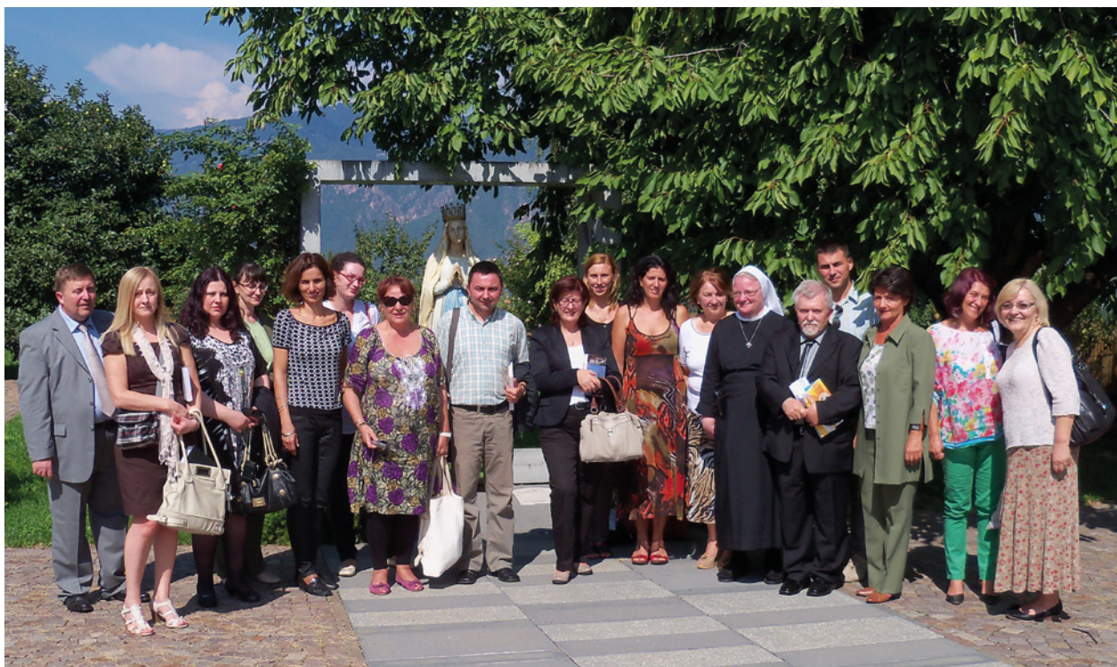
Care home directors from Vojvodina (Serbia) on the study trip through Germany, Austria and Italy in September 2012, here in the residential care home in Girlan/Eppan (South Tyrol)

The E.D.E. has been a member of the AGE Platform Europe ever since it was founded in 2001. The goal of AGE Platform Europe is to strengthen the cooperation between organisations which work to further the interests of elderly people in Europe. The tasks of this network focus on a broad range of political and social issues, including for example social integration, active ageing, pension reforms, violence against the elderly, intergenerational solidarity and gerontology.