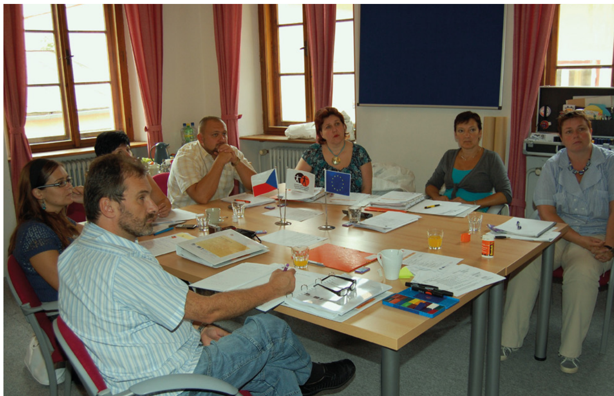
E-Qalin ® - Workshop in the Czech Republic, 2011

For further information, please go to our website www.ede-eu.org .