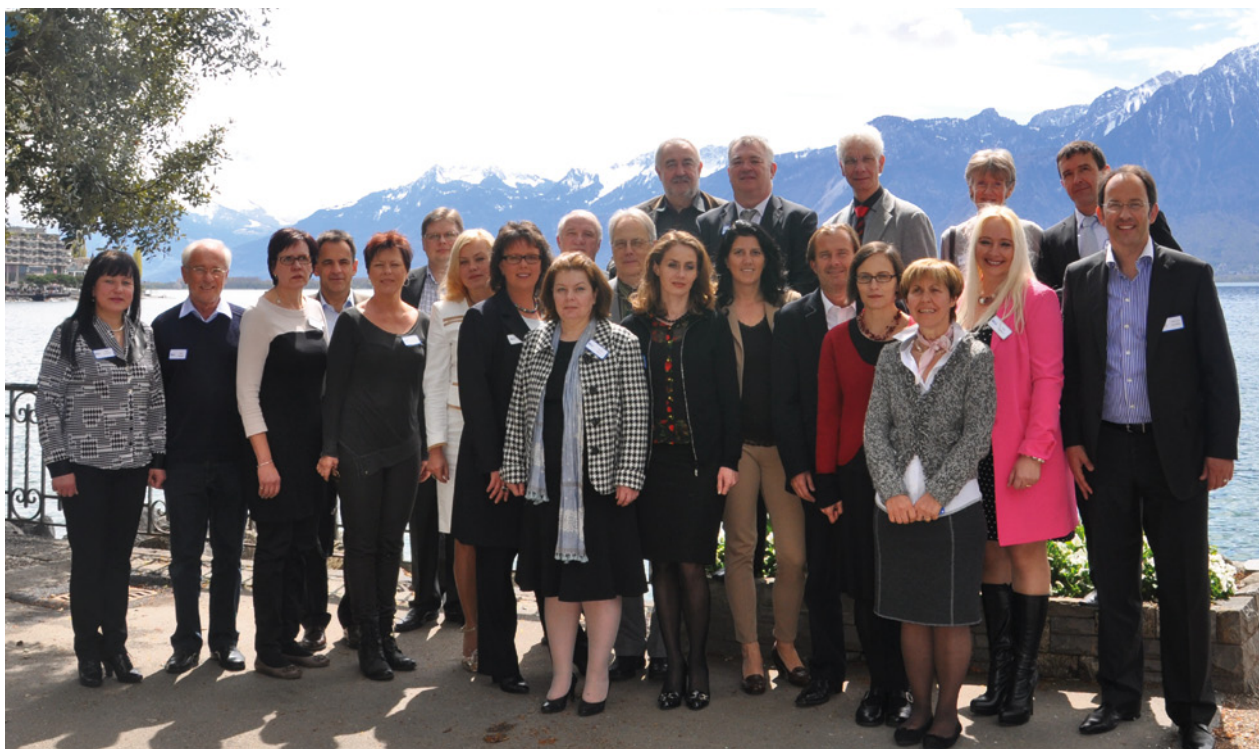
The E.D.E.'s General Board on 21 April 2012 in Montreux (Switzerland)

To arrive at a better understanding of the mutual challenges that this objective implies, representatives of associations for directors and providers of European care services met for the first time in Hamburg in 1987. An important goal at this meeting was to build and strengthen cooperation, and to initiate a regular exchange of information and experience between the various national associations. In addition, much attention was focussed during the discussions on how the quality of care and assistance for elderly people living in care homes – as well as working conditions in care facilities in Europe – can be improved by means of joint initiatives.