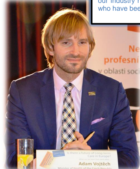
Is there a future of Long-term Care in Europe? Adam Vojtěch Minister of Health of the Czech Republic