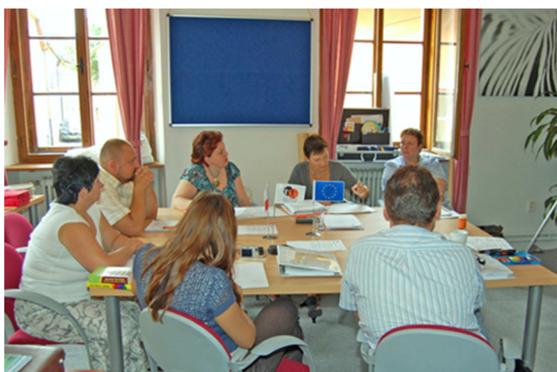
First part ot the E-Qalin instructor training, 18 – 20 August 2010 in Tábor

The Czech association is currently translating all the material, training the Czech instructors and promulgating E-Qalin, among other